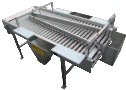
Roller inspection table with waste chutes, separation ducts and cutting boards

Employing two chain wheels with double bearings makes the need for end-to-end reverse axles obsolete. The bearings are dust and water proof due to the use of suitable labyrinth seals. The rollers are powered by a laterally arranged slip-on geared motor. Optionally, the roller inspection table can be equipped with one or two separation ducts. For example, this allows passed and failed produce to be directed to different areas. The roller inspection table can also be equipped with waste chutes for failed product. The frame of the machine consists of a strong sheet metal construction in stainless steel. The legs are height-adjustable, with an adjustment range from 700 mm to 1,000 mm. The rollers are powered by a laterally arranged slip-on geared motor. In the case of long-shaped produce, such as carrots, it is important to design the feed such, that the field crop is fed crosswise onto the roller inspection table. Inspection conveyor belts can be used as an alternative for such products; these are also manufactured by the Schneider company.